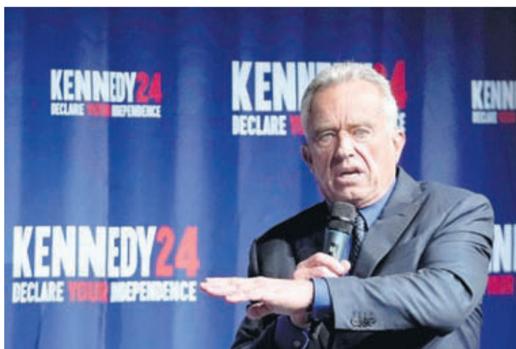
Presidential candidate Robert F. Kennedy Jr., speaks during a campaign event at the Adrienne Arsht Center for the Performing Arts of Miami-Dade County, Thursday, Oct. 12, 2023, in Miami.

is an expensive and time-consuming endeavor, with rules varying vastly across states.